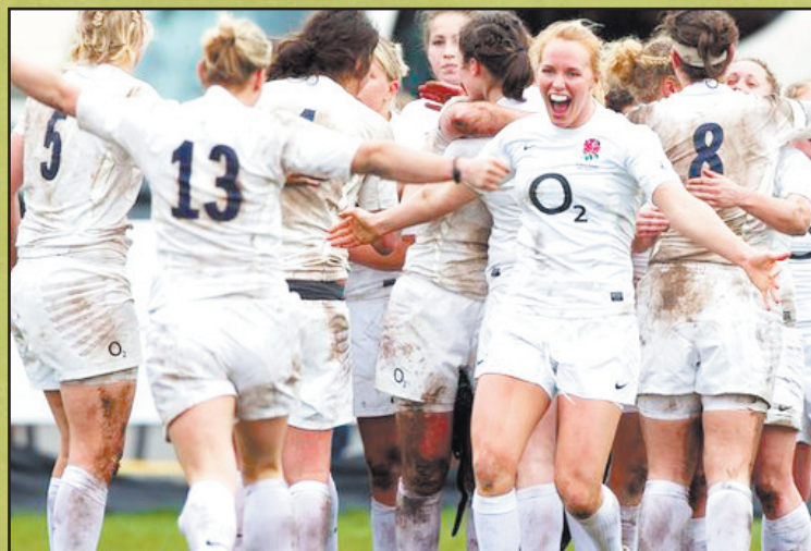
● The children will also visit the Army Rugby Union stadium in Aldershot to watch the England Women's XV take on New Zealand Women's XV