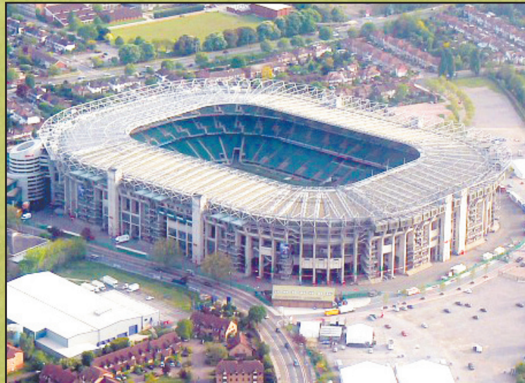
● Tour stops for the Bulldogs will include a visit to the home of England Rugby – Twickenham stadium, London

● For more information on the Bielefeld Bulldogs contact WO2 Gary Walker on 0521 9254 3448 or Mil 94 881 3448.